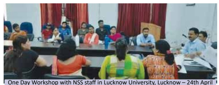
One Day Workshop with NSS staff in Lucknow University, Lucknow – 24th April