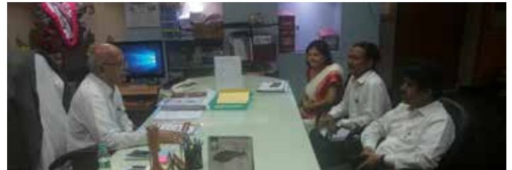
Interaction with Hon'ble Vice Chancellor and Registrar regarding UBA programs