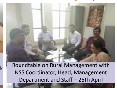
Roundtable on Rural Management with NSS Coordinator, Head, Management Department and Staff – 26th April