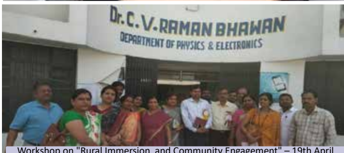
Workshop on "Rural Immersion and Community Engagement" – 19th April