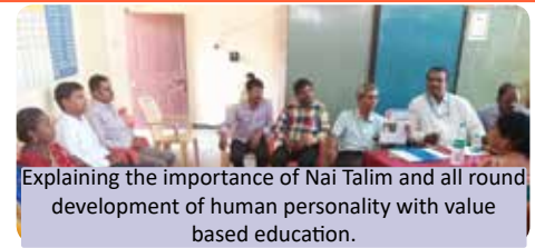
Explaining the importance of Nai Talim and all round development of human personality with value based education.