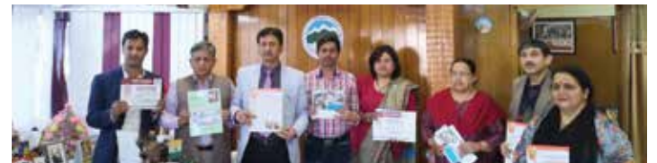
A Roundtable on introduction of community engagement curriculum through NSS programme was conducted in Himachal Pradesh University on 2nd April.