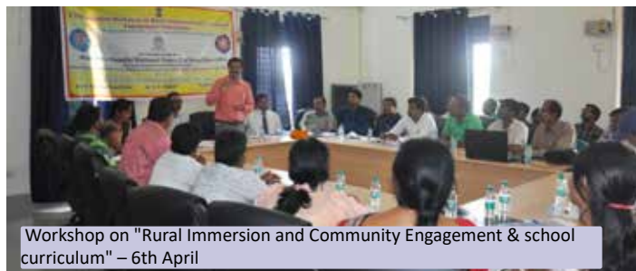
Workshop on "Rural Immersion and Community Engagement & school curriculum" – 6th April