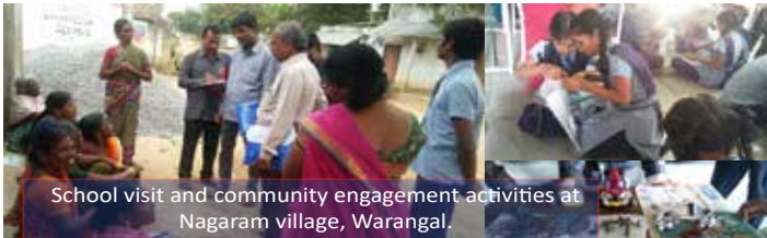
School visit and community engagement activities at Nagaram village, Warangal.