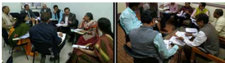
A wonderful, interactive and participative session with State NSS Officers

All participants welcomed the idea of a structured course for NSS Volunteers and unanimously assured support to the collaboration with MGNCRE. They participated enthusiastically in discussing the Draft Community Engagement Curriculum and suggested changes to suit NSS needs. They also appreciated the need for one University department (Social Work/Sociology/ Management/Teacher Education/Communication) in their State’s key university to anchor this by having it approved by their Board of Studies as 2 or 3 or 4 credit course.