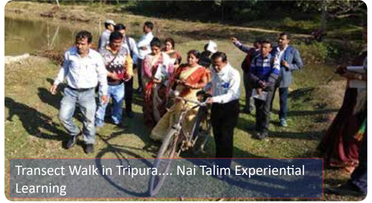
Transect Walk in Tripura.... Nai Talim Experiential Learning