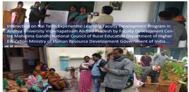
Interaction on Nai Talim Experiential Learning Faculty Development Program in Andhra University Visakhapatnam Andhra Pradesh by Faculty Development Centre Mahatma Gandhi National Council of Rural Education Department of Higher Education Ministry of Human Resource Development Government of India...