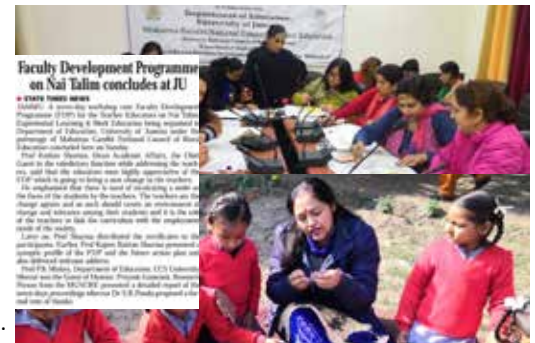
Class 2 Students learning to re-use waste material as a part of Nai Talim, during FDP at University of Jammu