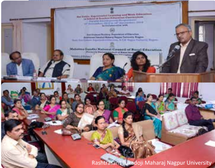
Rashtrasant Tukadoji Maharaj Nagpur University