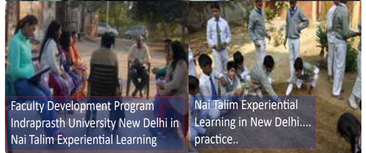
Faculty Development Program Indraprasth University New Delhi in Nai Talim Experiential Learning