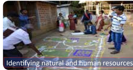
Identifying natural and human resources