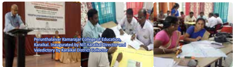
Perunthalaivar Kamarajar College of Education, Karaikal. Inaugurated by MIT Karaikal Director and Valedictory by Karaikal District Collector