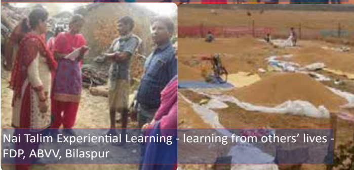
Nai Talim Experiential Learning - learning from others' lives - FDP, ABVV, Bilaspur