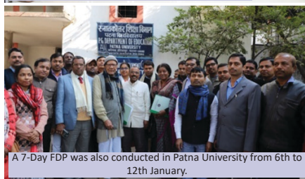
A 7-Day FDP was also conducted in Patna University from 6th to 12th January.