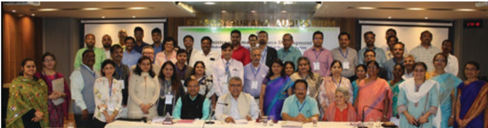
As a follow up to the workshop, meetings and roundtables were organized at their university premises to give inputs and support to the introduction of the MBA Programme in their Universities.