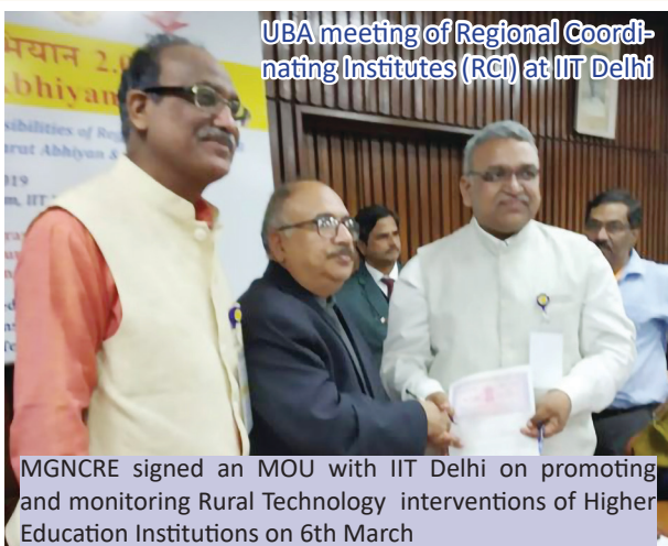
UBA meeting of Regional Coordinating Institutes (RCI) at IIT Delhi