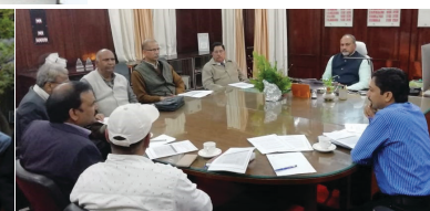
A Roundtable was conducted at the Department of Education, Lalit Narayan Mithila University, Darbhanga, Bihar on 7th February, 2019.