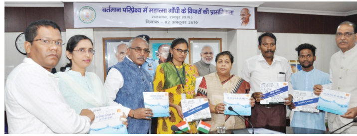
Towards Water and Swachhta Smart Campuses - Honourable Governor of Chhattisgarh Sushri Anusuiya Uikay with Hindi and English versions