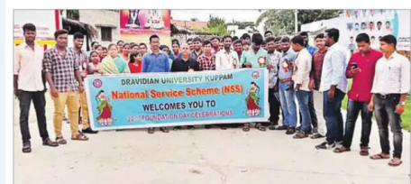
Dravidian University Team at Gudupalli Village