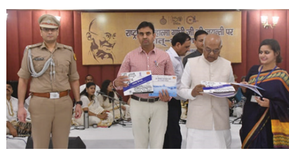
Honourable Governor of Haryana Shri Satyadev Narayan Arya "I look forward to the HEIs implementing these SOPs"