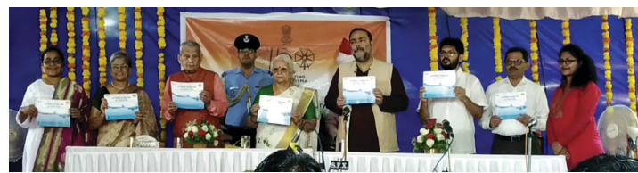
"Students will be empowered by the Jal Shakti and Swachh Campus Manuals" Honourable Governor of Goa Smt Mridula Sinha