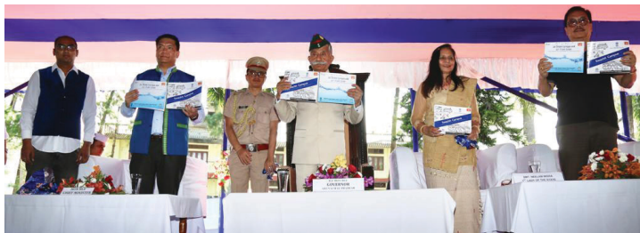
"The need of the Hour - Water and Cleanliness" - Honourable Governor Shri B. D. Mishra showing the way forward in Arunachal Pradesh. Also present on the occasion were Honourable Chief Minister, Shri Pema Khandu, First Lady of the State Smt. Neelam Mishra and Deputy Chief Minister Shri Chowna Mein