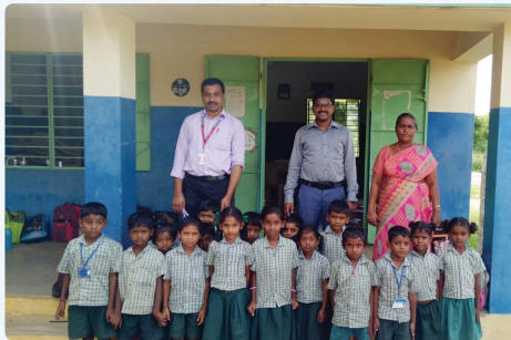
Sri Shanmugha College of Engineering and Technology Nodal Officer with Head Mistress and students of Primary School at Annaikalpalayam village