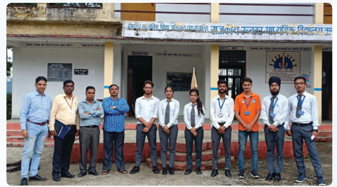
Swami Rama Himalayan University Team and MGNCRE Officer at Talla Bhanash High School