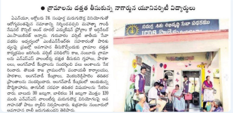
Acharya Nagarjuna Students at Khaja Nambur Village