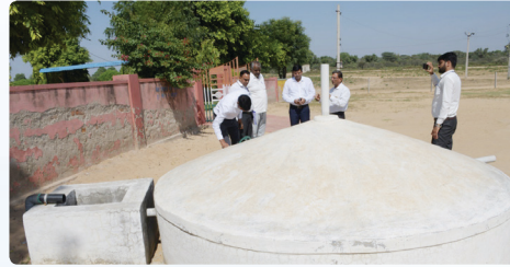
Staff of Prince Academy of Higher Education and MGNCRE Officer having a glance at Rain Water Harvesting System in Teterwalon ki dhani village