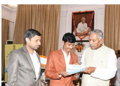
"What a remarkable tool for Educational Institutions! I am happy that the manual is available in Hindi also" Honourable Governor of Bihar Shri Phagu Chauhan