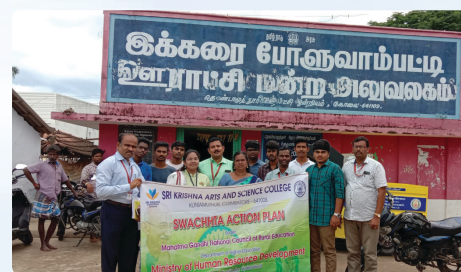
Sri Krishna Arts and Science College Team at Ikkarai Boluvampatty, Coimbatore