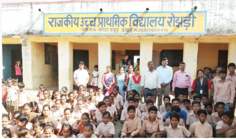
Rajkiya Uchh Prathmik Vidyalay, Rohhadi with staff of Kautilya Mahila T.T College as a part of Comprehensive Sanitation Management