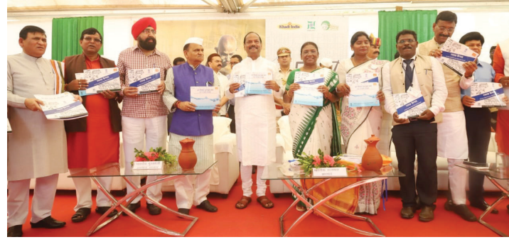
"Water Consciousness needs to be ingrained in students" - Honourable Governor Smt Draupadi Murmu. Honourable Chief Minister Shri Raghubardas and Cabinet Minister Shri C P Singh were also present.