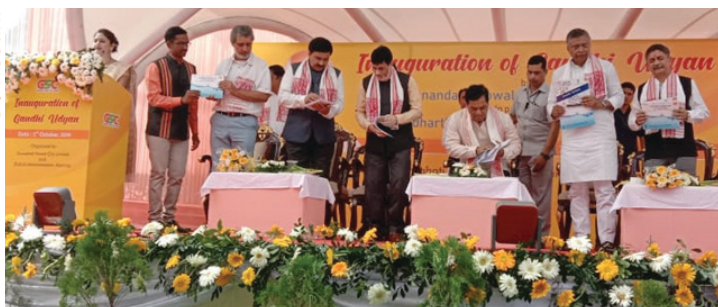
Powering Jal Shakti in Assam - added with Swachhta - Honourable Chief Minister Shri Sarbananda Sonowal doing the honours in the presence of Education Minister Shri Siddhartha Bhattacharya