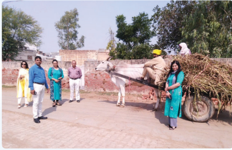
Maharshi Dayanand University Team at Rohtak