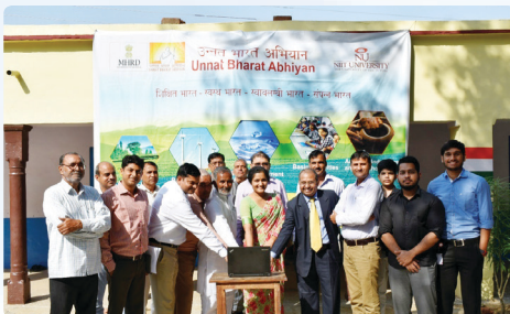
Nodal Officer and Assistant Nodal Officer, NIIT University, Rajasthan at Jalawas Village