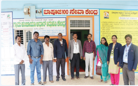
Garden City University Staff with Thornahalli PDO and Vice President at Thornahalli Village