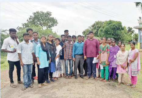
Alagappa University Team at Vettaikkaranpatti village