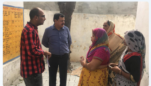
IGNOU Nodal Officer interacting with villagers of Bhatiana