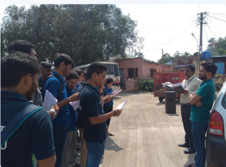
Orienting MIT College NSS students at Pimplagaon village