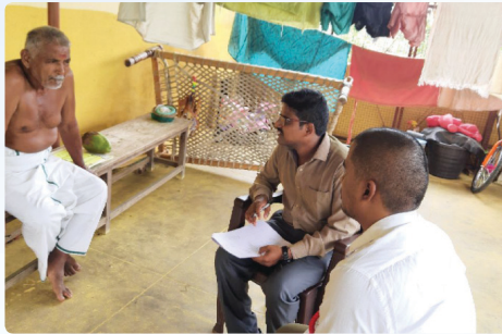
Interaction between MGNCRE Officer, and Kongu Engineering College Nodal Officer and a villager at Chinnaiyampalayam village