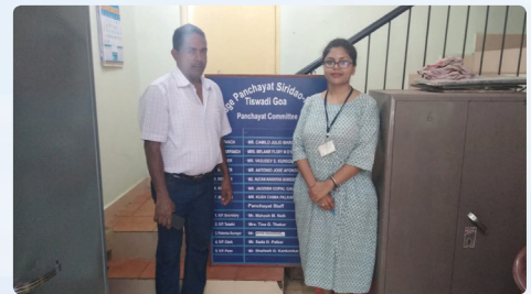
MGNCRE Officer with the Sarpanch, Sirdao-Palem village