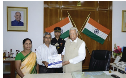
"A very innovative and enterprising initiative - This will trigger good results for the country" Honourable Governor of Karnataka Shri Vajubhai Vala