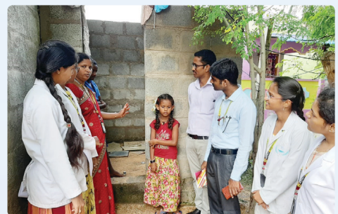
Seven Hills College of Pharmacy at Venkatramapuram village

We know that by seeing.. The utmost priority for them is villagers' well being..