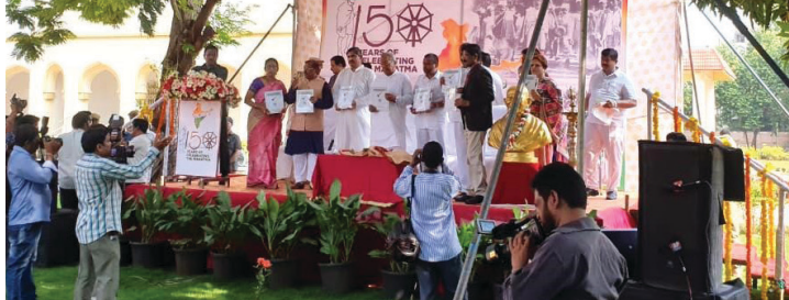
Towards Swachhta and Jal Shakti - Honourable Governor Shri Biswa Bhusan Harichandan - Paving the Way Forward in Andhra Pradesh!