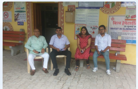
The NorthCap University Nodal Officer at Choma village, Gurugram

We got to feel the rural soil.. To see all their work and toil.. Targeting for open defecation free..