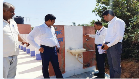
Prince Shikshak Prashikshan Mahavidyalaya Nodal Officer at 100 % ODF Shyampura Village