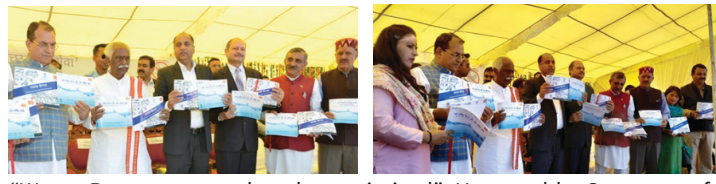
"Water Resources need to be optimized" Honourable Governor of Himachal Pradesh Shri Bandaru Dattatreya said on the occasion. Also present were Chief Minister Shri Jai Ram Thakur and Education Minister Shri Suresh Bharadwaj