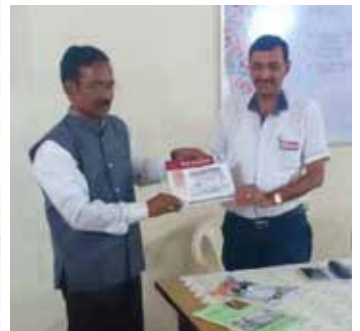
Introducing Nai Talim and Experiential Learning to Principal Sri Machh Maharaj College of Education at Daman UT on 28th September