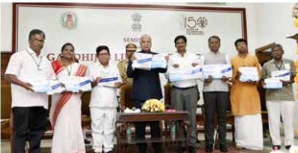
Honourable Governor of Tamil Nadu Sri Banwarilal Purohit inaugurated Seminar on “Gandhiji’s Life and Thoughts” and launched the MGNCRE Manuals - Jal Shakti Campus and Jal Shakti Gram and Swachh Campus on 27th September as part of Mahatma Gandhi’s 150th Birth Anniversary celebrations.