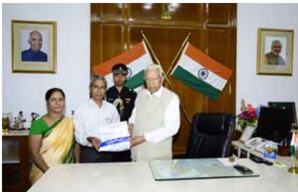
Release of Jal Shakti Campus and Jal Shakti Gram and Swachh Campus Manuals by Honourable Governor of Karnataka Shri Vajubhai Vala at Raj Bhavan Bangalore on 30th September

MGNCRE Team is visiting schools and B.Ed Colleges across all states and union territories of the country as part of our Outreach and Connect with Experiential Learning. Responding to our request, educational institutions across India have conducted National Nai Talim Week – a campaign of work based learning - in the context of Gandhiji’s 150th Birth Anniversary Celebrations. The campaign would culminate or could be initiated with celebration of 2nd October as National Nai Talim Day in all Schools and Higher Education Institutions in the country.