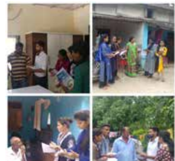
Village Visit by students of Sri Machh Maharaj College of Education Daman UT - 28th September