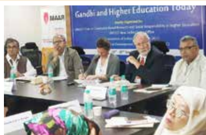
Educating the Mind, Body and Heart – Chairman MGNCRE attending International Dialogue on Gandhiji and Higher Education Today UNESCO Chair Session at UNESCO New Delhi