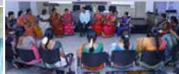
Workshop for Women on occasion of 50th anniversary of NSS

24th September One- Day Workshop at PSG College Coimbatore