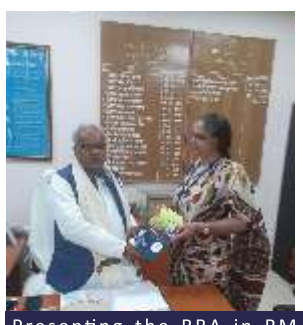
Presenting the BBA in RM Curriculum to Shri Sharwan Kumar, Hon'ble Minister of Rural Development, Bihar