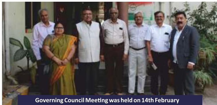
Governing Council Meeting was held on 14th February