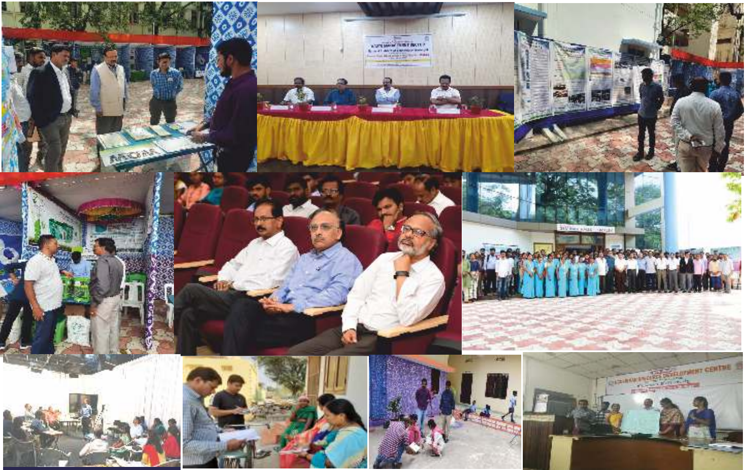
One-day training program on Rural Immersion for UBA Coordinators/NSS PO's at MGNCRE Hyderabad 15 Feb