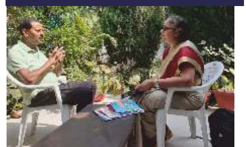
Meeting with Shri Cheddi Paswan, Hon'ble MP Sasaram Bihar