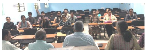
Informal discussion with students on Skilling in Teacher Education