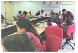
Chairman MGNCRE interacting with students at NERIE NCERT Shillong