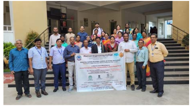
Workshop at Matrusri Engineering College Hyderabad