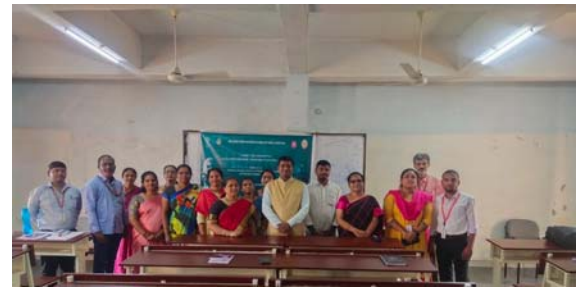
Workshop at Medchal Malkajgiri District at Gokaraju Rangaraju Institute of Engineering and Technology (GRIET)