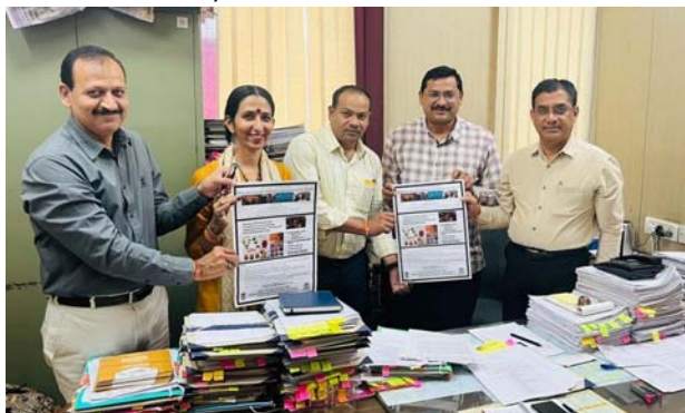
Poster being released in Higher Education Commissioner's Office, Madhya Pradesh

As the country observes National Entrepreneurship Month 19th Oct – 20th Nov 2022 , MGNCRE has called for Competitions on Entrepreneurship in Higher Education Institutions all over the country. Posters were released by District Collectors and administrative heads.