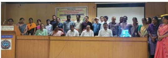
Workshop at Kakatiya University, Warangal, Telangana