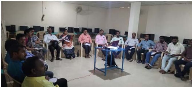
Workshop at SRR Degree College, Jangoan District, Telangana 14 Institutions participated