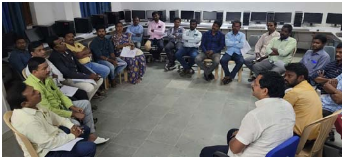
Workshop at Government Degree College, Mahabubabad Telangana 28 participants from 16 institutions