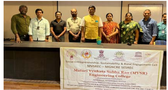
Workshop at MVSR Engineering College Hyderabad