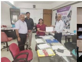
SCERT Madhya Pradesh

Post the National Workshop, SCERTs of different states expressed interest in taking the agenda forward.