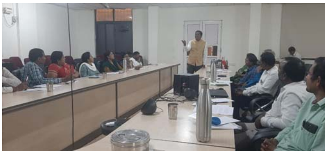
Workshop at MG University Nalgonda