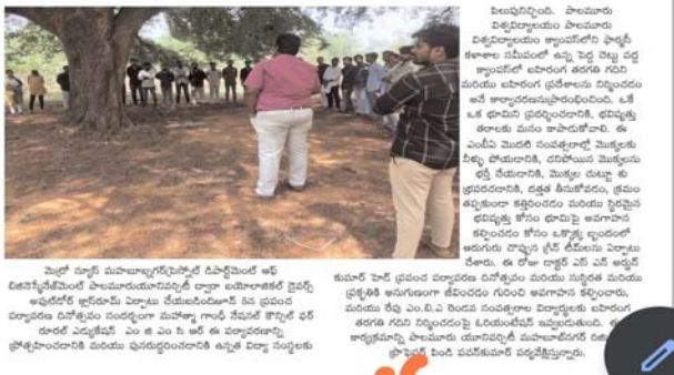
Department of Business Management, Palamuru University, Mahubunagar, Telangana organized outdoor classroom as environmental day activity