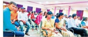
मौजूद शिक्षक व छात्र-छात्रा.