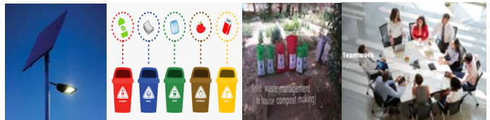
Energy Conservation, Waste Management, Forming Teams, Organizing Campaigns – HEIs can contribute immensely to the cause of Environment Protection