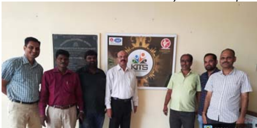
Meeting with faculty members of Khammam Institute of Technology, Khammam to ensure Swachhta Abhyaan in campus.

Academic Consultant of MGNCRE conducting a round table meeting with MBA faculty and students of Vidya Jyoti Institute of Technology for promoting Swachhta, Sustainability and Rural Immersion activities. He also discussed various energy conservation practices to be taken forward on the occasion of World Environment Day.