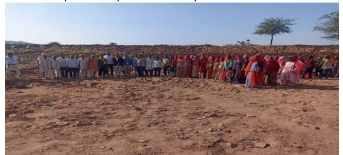
Village visit to Nandiya Kalan - Osian Tehsil in Jodhpur District