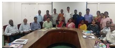
Workshop at SCERT Telangana