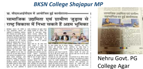
BKS College Shajapur MP