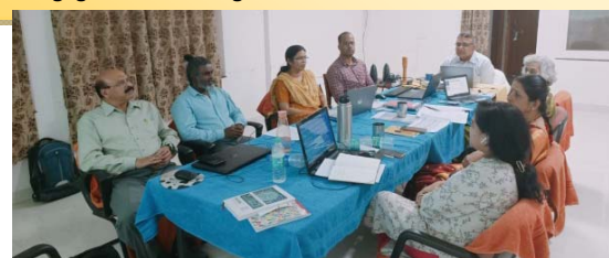
FDP in progress at FDC MGNCRE