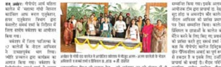
Higher Education Institutions, Fazilka Nodal officers extend all the support to promote Entrepreneurship activities, Swachhta activities and promoting sustainability in all Higher Educational Institutions of Fazilka. Poster of

I hope that the new year will give you a larger spirit of sacrifice, greater steadiness of purpose and a more vivid appreciation of self-restraint. Mahatma Gandhi