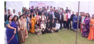
Daly College of Business Management DCBM Indore