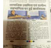
Nehru Govt. PG College Agar Malwa MP