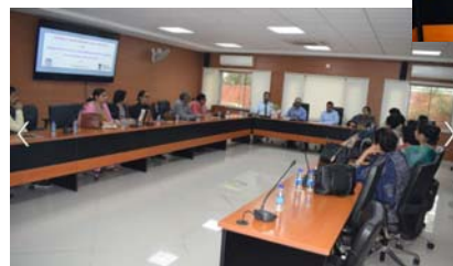
Round Table Meeting with Principals of Higher Education Institutions of Chandigarh