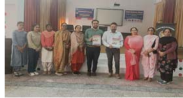
Shri Suraj, PCS Additional Commissioner Ludhiana Punjab entrepreneurship activities was launched by the representatives HEIs of Barnala .