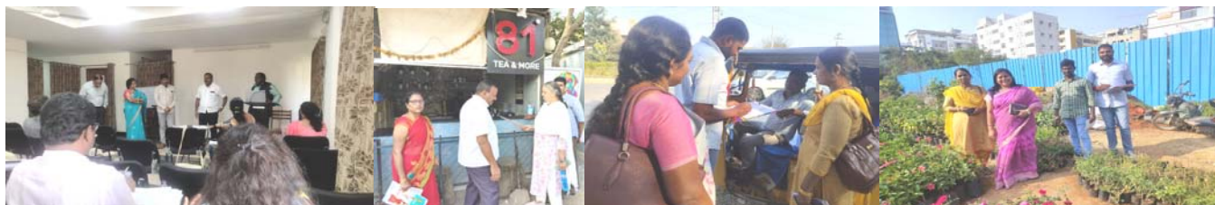
Group Activities, Role Plays, Presentations