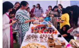
MCM celebrates Women Entrepreneurship Day with 3-day workshop on Oyster Mushroom Cultivation