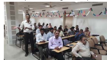
Workshop in Haveri district addressed by industrialist Shri Ravi Mudhol