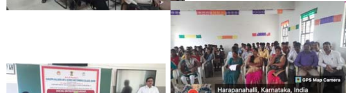
Workshop on 22 nd Nov at Harapanahalli, Vijayanagara District Karnataka