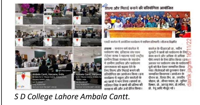
S D College Lahore Ambala Cantt.

अमृतसर (पीएनएस) उत्तराखण्ड की प्रख्यात महिला शिक्षण संस्थान में 20 अक्टूबर को 'महामाता गांधी राष्ट्रीय उद्यमिता माह' के अवसर पर 'एमसीएम' का आयोजन किया। कार्यक्रम में 'दिवाली उत्सव' और 'एंटी-कैंसर जागरूकता रैली' का आयोजन किया। कार्यक्रम में 'महामाता गांधी राष्ट्रीय उद्यमिता माह' के अवसर पर 'एमसीएम' का आयोजन किया। कार्यक्रम में 'दिवाली उत्सव' और 'एंटी-कैंसर जागरूकता रैली' का आयोजन किया।