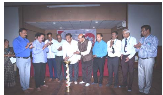
Inauguration of the workshop in Bidar by President of the Karnataka Educational Institutions and other HEIs.