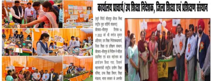
Workshops on Social Entrepreneurship promoting Entrepreneurship Activities in Uttar Pradesh A few glimpses.....

District Institute of Education and Training, Khairabad, Sitapur