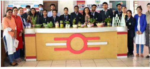
Student Self Help Group Ghaziabad