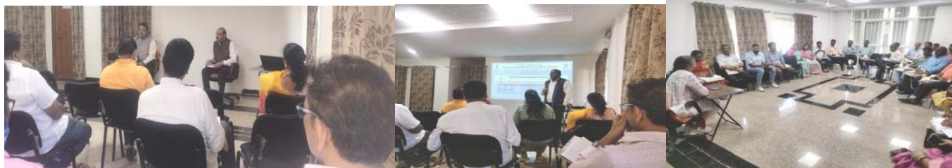
Chairman MGNCRE addressing the inaugural session