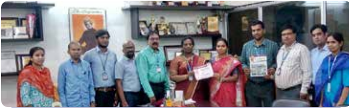
UBA meeting in Spoorthy Engineering College with Principal, UBA coordinator and all Department HODs