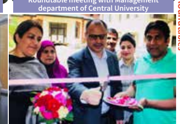
Inauguration of Gandhian Study Centre at Cluster University Srinagar