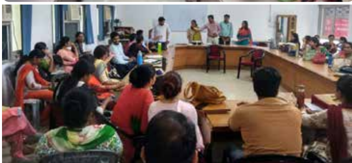
At HRDC, BPS Women University, Khanpur, Sonipat, Haryana