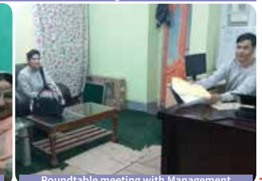
Roundtable meeting with Management department of Central University