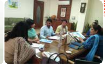
Round Table meeting with BoS, Panjab University, Chandigarh, 18th May