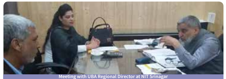
Meeting with UBA Regional Director at NIT Srinagar