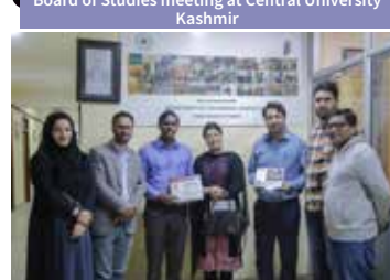
Board of Studies meeting with Department of Communication and Journalism at Central University Ghanderal Kashmir