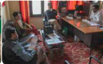
Central University Kashmir Department of Convergent Journalism