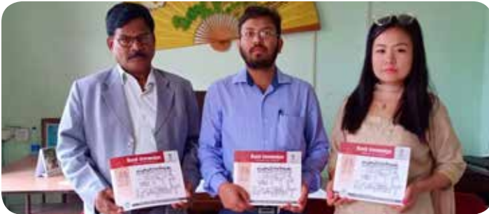
Roundtable meeting at Vinayaka University with the Registrar and UBA Coordinator