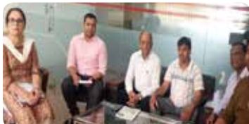
Roundtable at CDLU, Sirsa, Haryana on Nai Talim with Registrar and Dean