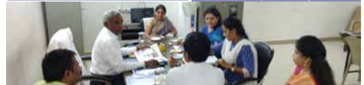
Roundtable meeting at Nagole Institute of Technology and Science with Principal and UBA Coordinator