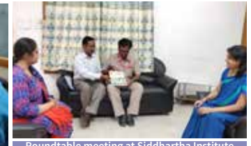
Roundtable meeting at Siddhartha Institute of Technology and Sciences with Chairman, Principal and faculty