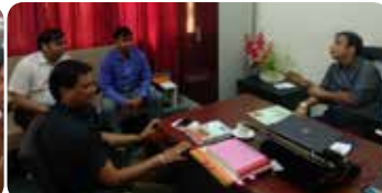
Roundtable at Gurugram University Gurugram 30th May