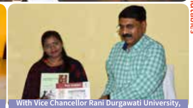
With Vice Chancellor Rani Durgawati University, Jabalpur.