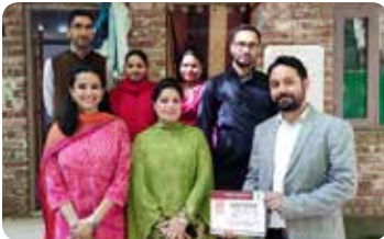
Curriculum Intervention Meeting with P&G department at Central University Kashmir