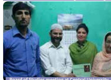
Board of Studies meeting at Central University Kashmir