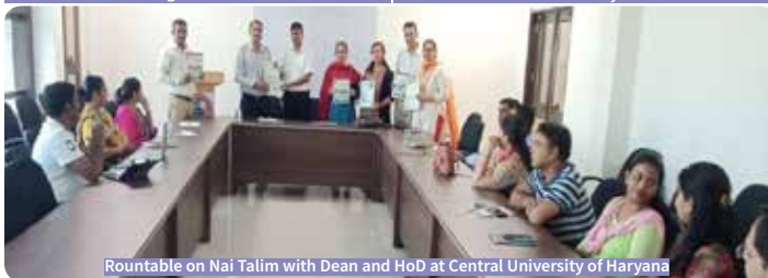
Roundtable on Nai Talim with Dean and HoD at Central University of Haryana