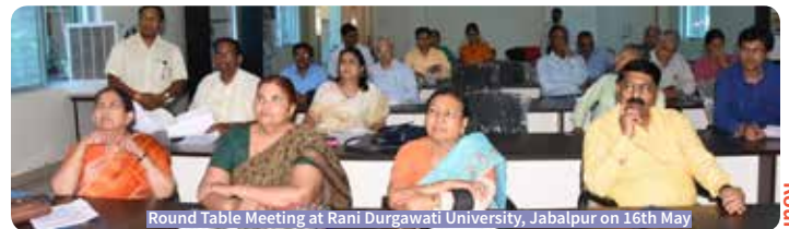
Round Table Meeting at Rani Durgawati University, Jabalpur on 16th May