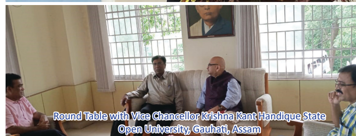
Round Table with Vice Chancellor Krishna Kant Handique State Open University, Gauhati, Assam