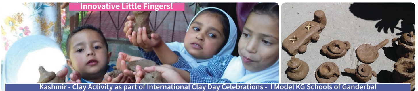
Kashmir - Clay Activity as part of International Clay Day Celebrations - I Model KG Schools of Ganderbal