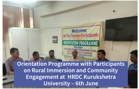
Orientation Programme with Participants on Rural Immersion and Community Engagement at HRDC Kurukshetra University - 6th June