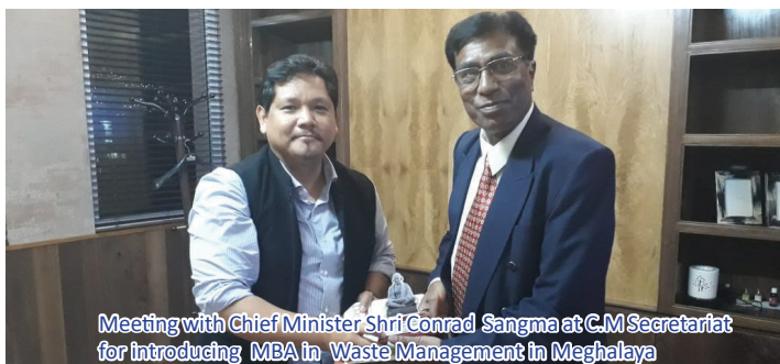
Meeting with Chief Minister Shri Conrad Sangma at C.M Secretariat for introducing MBA in Waste Management in Meghalaya