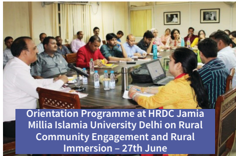
Orientation Programme at HRDC Jamia Millia Islamia University Delhi on Rural Community Engagement and Rural Immersion - 27th June