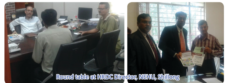
Round table at HRDC Director, NEHU, Shillong