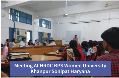
Meeting At HRDC BPS Women University Khanpur Sonapat Haryana