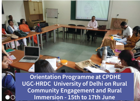
Orientation Programme at CPDHE UGC-HRDC University of Delhi on Rural Community Engagement and Rural Immersion - 15th to 17th June