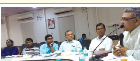
RGUKT, Basar 22 nd December