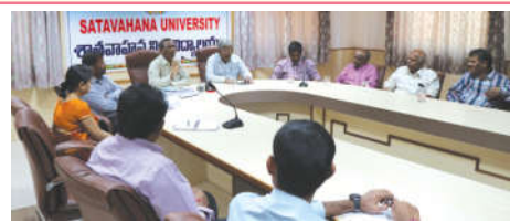
Satavahana University, Karimnagar 4 th & 11 th December