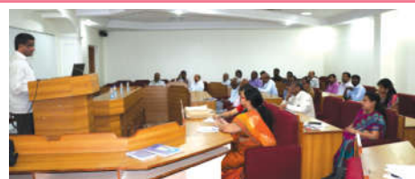
Dr B R Ambedkar Open University, 14 th & 16 th December