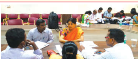
Palamuru University, Mahabubnagar, 15 th December