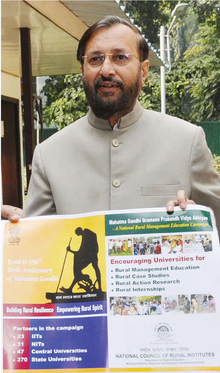
Minister Shri. Prakash Javadekar at the launch of Rural Management Education

Huge dearth of professionally trained and qualified rural managers will be filled with the curricular interventions of NCRI, which has taken on the onus to work with 370 state universities, 47 central universities, 31 NITs and 23 IITs with Rural Management and Rural Technology management courses, through Mahatma Gandhi Grameen Prabandh