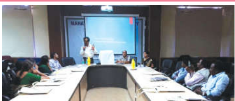
Mahatma Gandhi University, Nalgonda, 12 th - 13 th December