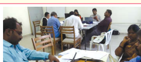
Potti Sreemulu Telugu University, 28 th December