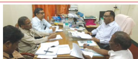
Osmania University, 19 th - 22 nd December