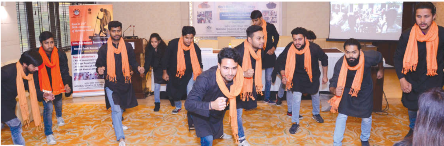
A scene from Nukkad Natak enacted on the occasion. The play featured rural concerns and related issues and was well-received by the audience