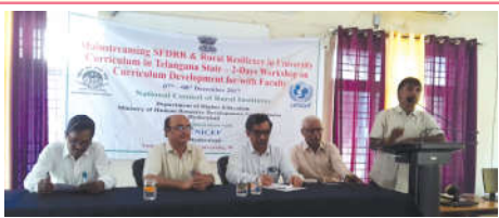
Telangana University, Nizamabad, 7 th - 8 th December