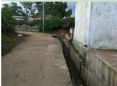
Roads in the village