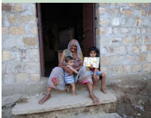
An elderly woman teaching her grandchildren in Paldev