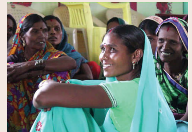
Empowering Women: The SHGs (Self Help Groups) are being formed to train women in various professions