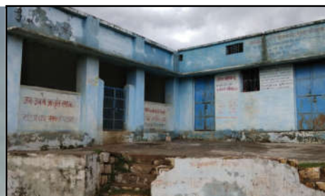
Anganvadi Bhavan in Paldev