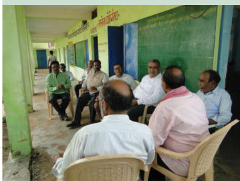
Chairman and Member Secretary of NCRI in a conversation with the teachers at the primary school in Paldev