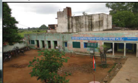
Primary School in Paldev