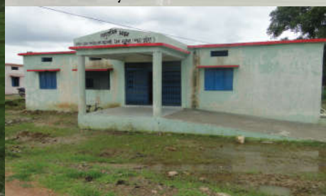
Community hall in Paldev

Percentage of the pupils who passed Matriculation skyrocketed to 51% from 11%, same was the case with Intermediate as the percentage of the pass outs went up to 82% from 28%.