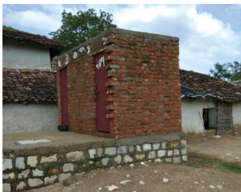
Shauchalay in the village

With MGNREGA plan in action, people participate in developing their village. Horticulture in the village started after the minister had adopted the village under SAGY. Through SAGY they have successfully planted 5000 saplings with the support of local youth groups. They have also laid a steel fencing on the borders of the village pond so that the animals won't pollute it. Most people are content with the efforts and the developments made by the administration after the village was adopted by the Honorable Minister and with the constant efforts of his team. There are quite a few projects which are to be completed. The village administration plans to finish them at the earliest possibility with the support from the Honorable HRD Minister Shri Prakash Jawadekar.