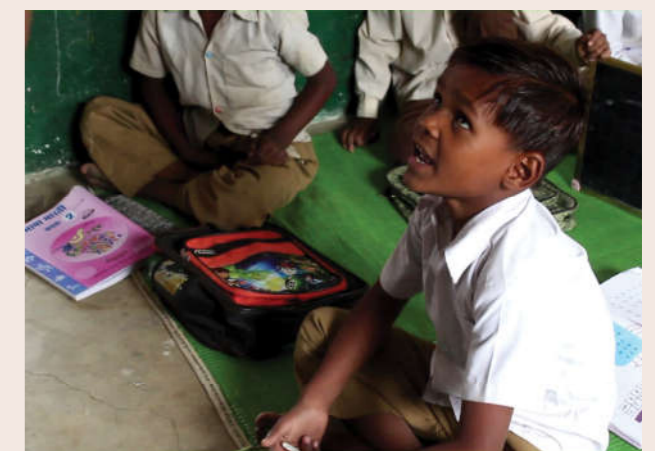
Bringing Out the Best: Students at the school, Khutiya