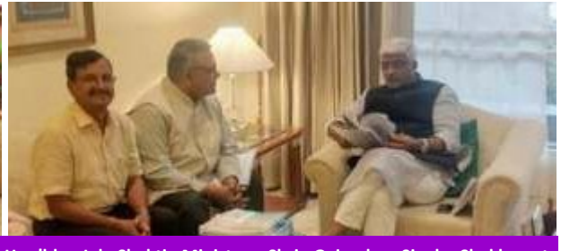
Hon'ble Jal Shakti Minister, Shri Gajendra Singh Shekhawat appreciates the efforts of MGNCRE for publishing Jal Shakti Campus and Jal Shakti Gram Manuals in 15 languages