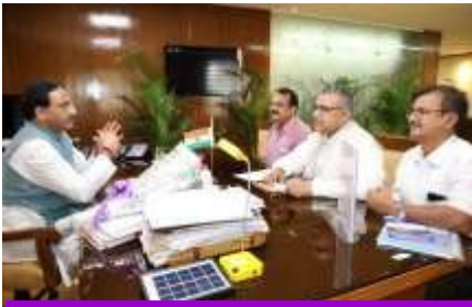
Discussing MGNCRE Agenda with Hon. HRM Shri Ramesh Pokhriyal