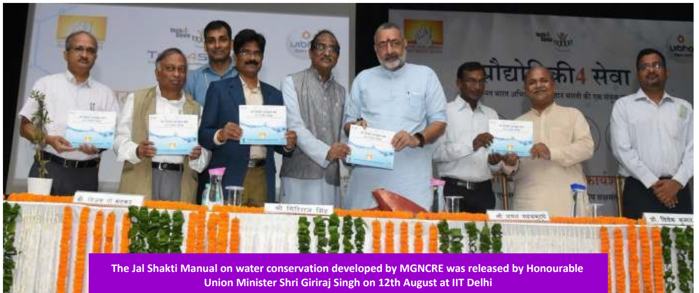
The Jal Shakti Manual on water conservation developed by MGNCRE was released by Honourable Union Minister Shri Giriraj Singh on 12th August at IIT Delhi

Jal Shakti Campus and Jal Shakti Gram – a Water Conservation Action and Implementation Plan for Higher Education Institutions - was released by Honorable Minister Shri Giriraj Singh. The manual is intended to help Higher Education Institutions including Universities, Colleges and Polytechnics in developing strategies, action plans and implementation plans for water conservation on the campuses and in the villages with which the campuses are engaged with. The manual is a how to guide on water management measures including conservation measures such as water budgeting, water metering, water audit, water demand study, reduction in water losses and management of demand and supply of water in a campus and the villages with which the Higher Education Institutions are engaged with in National Service Scheme (NSS), Swachhta Action Plan (SAP) and Unnat Bharat Abhiyan (UBA).