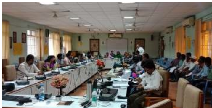
Chairman MGNCRE conducting Nai Talim Workshop at Osmania University