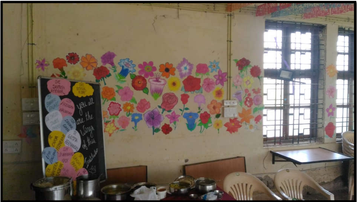
Art and Craft work done by students to beautify their seminar hall