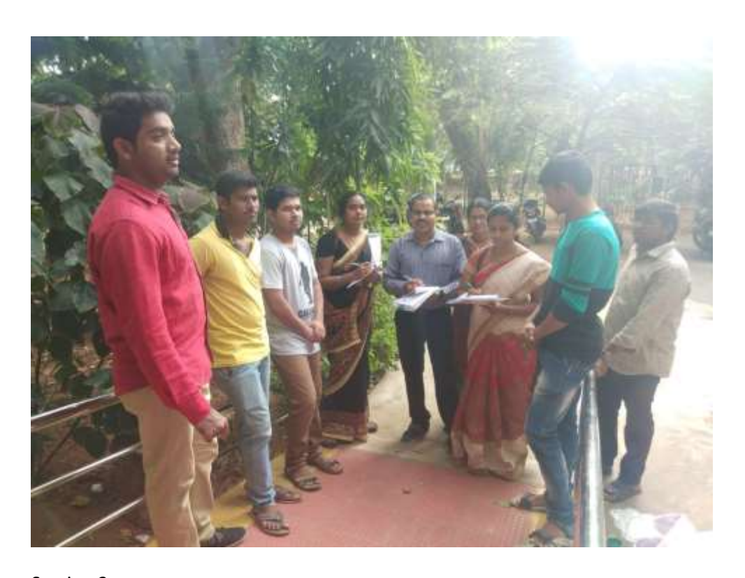
Session 2: Participants prepared school activities and presented.