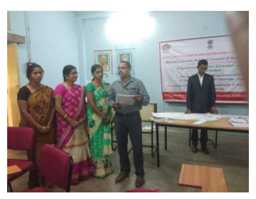
Participants designed activities for the classes.