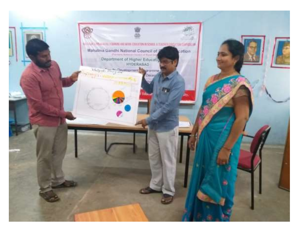
Session 3: Honored a woman employee as part of Nai Talim to promote dignity of labor