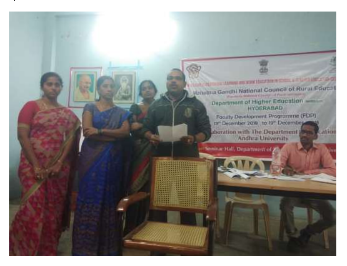
Session 2: Preparation in School B.Ed. curriculum& village visit activities.